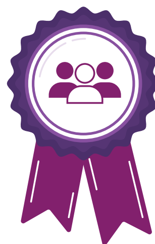
Certificate of Attendance