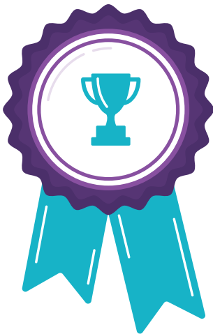
Certificate of Achievement