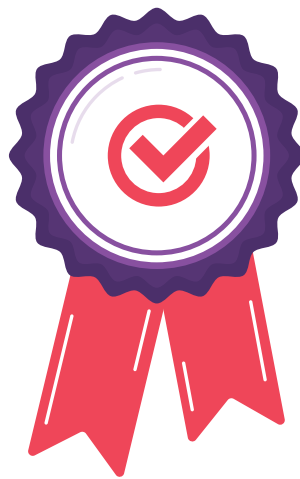
Certificate of Completion