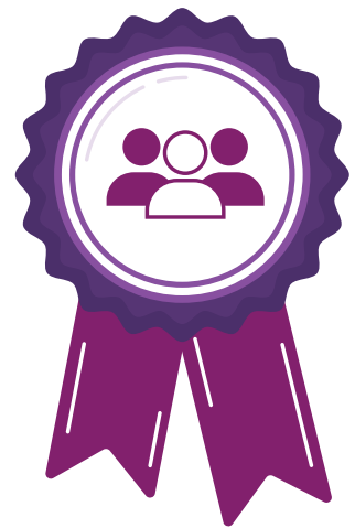
Certificate of Attendance